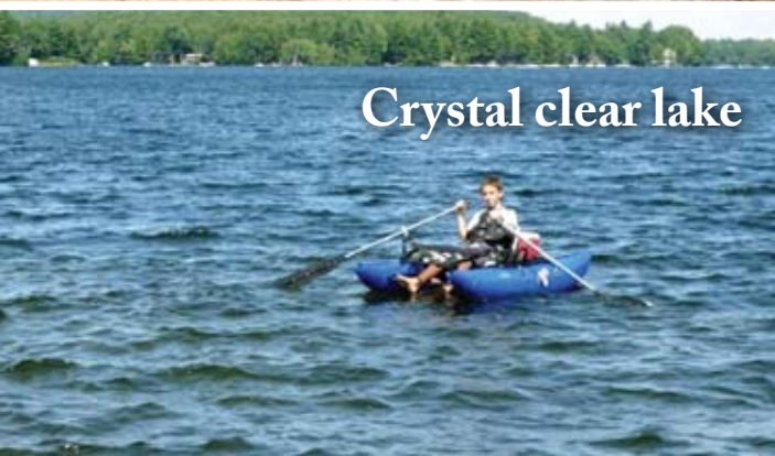
Crystal clear lake